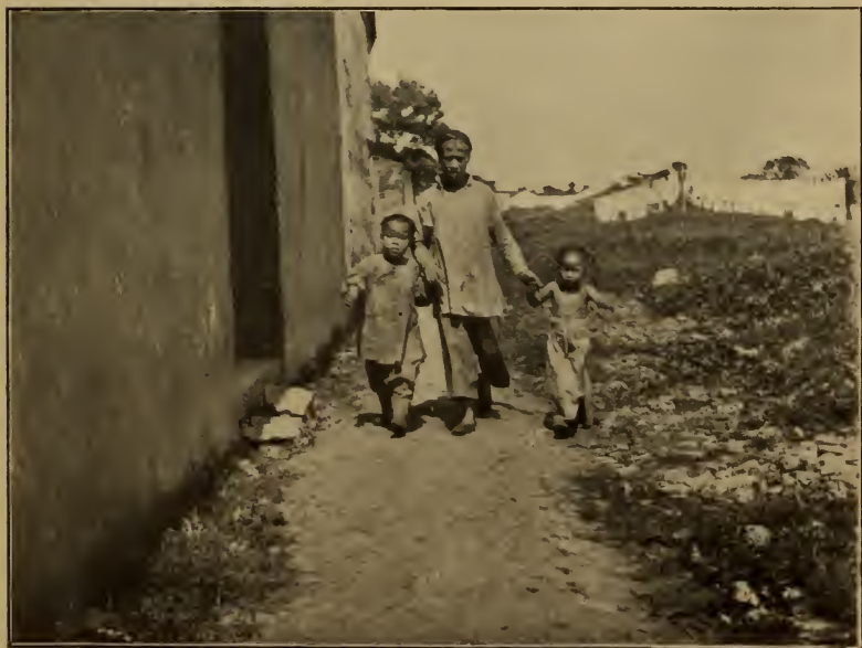
GOING TO A CHRISTIAN SCHOOL.